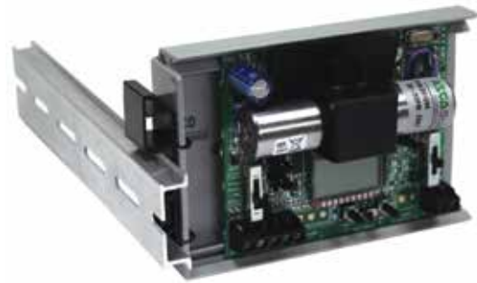
DIN-L1 with UCP-722 and DIN rail mounted (DIN rail not included)